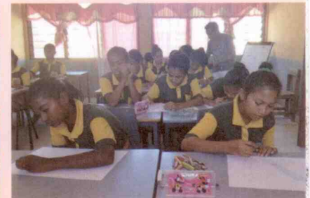
Honorable Mention Winners Title: Top / River and Forest, Bottom / Environment